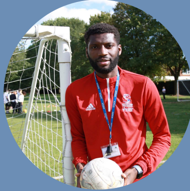
Sports Coach 19 Months including EPA