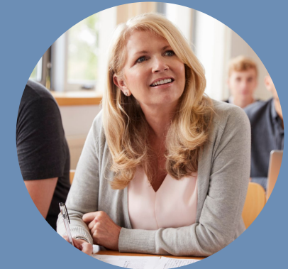
Senior Lead (NPQSL) 19 Months including EPA