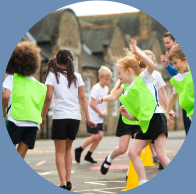
Teaching Assistant (PE Focus) 13-15 Months including EPA