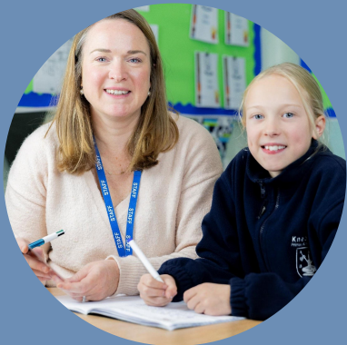
Teaching Assistant (SEND Focus) 13-15 Months including EPA