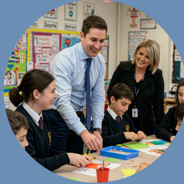
Assistant SENCO 17 Months including EPA