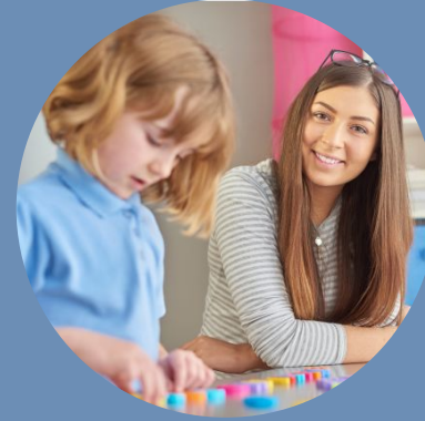
Early Years Practitioner 15 Months including EPA