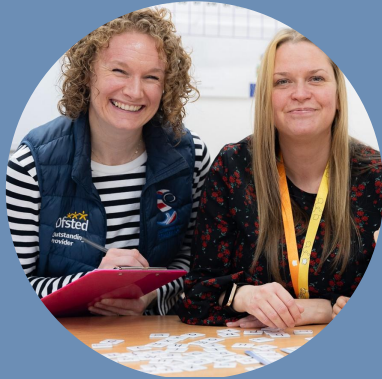
Specialist Teaching Assistant 19 Months including EPA