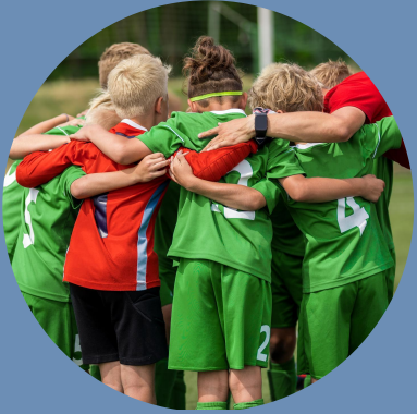
Community Activator School or Community 13-15 Months including EPA