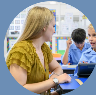
Senior Lead (Advanced SEND Lead) 19 Months including EPA