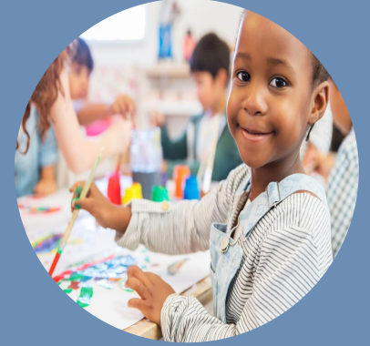
Early Years Educator 16 Months including EPA